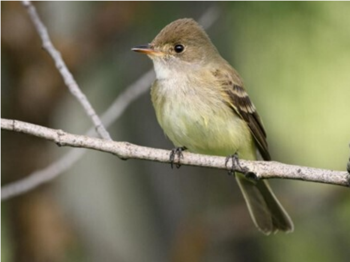
A picture of the Willow Flycatcher on a branch in the wilderness.

Other ways to help can be: volunteer at national parks and parks or other forms of nature organizations to help clean trash, slow down when driving, make your home more wilderness friendly, don't purchase products